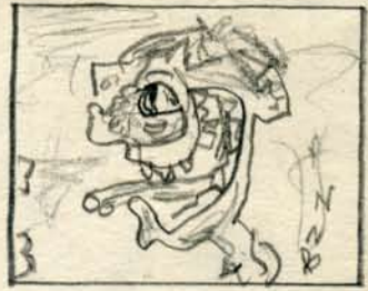
TYPICAL ODD READER

Dear Sirs, You've had blood, guts, and toilet bowls, but with the latest typical ODD reader you've gone too far. You can be sure I'll never ODD again! BUY Gordon Imbicili New York N.Y.